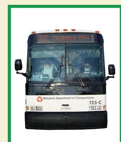
MTA Commuter Bus